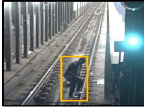
Track intrusion event capture