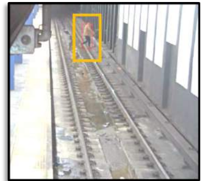
Track Intrusion Detection