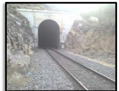
Tunnel Intrusion Detection