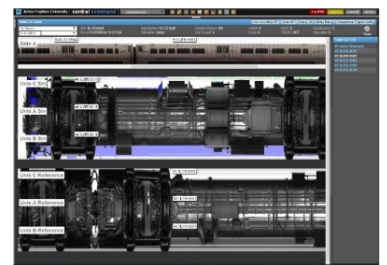
centraco ® Transit User Interface