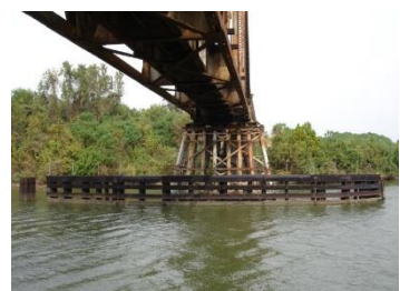
Collision Impact Analysis