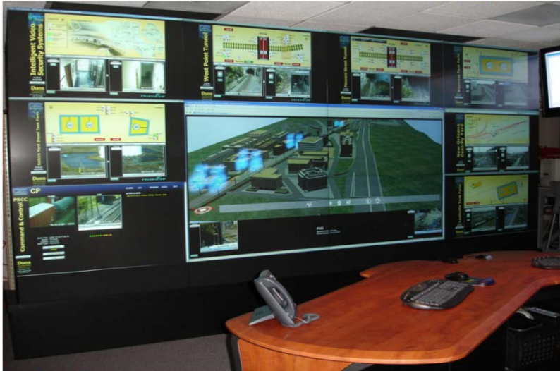
Sample Command & Control Facility

Duos Technologies Inc. provides a broad range of sophisticated intelligent technology solutions with an emphasis on mission critical applications. We combine an innovative business philosophy with a focus on customer service. Our specialty is the development and delivery of customized turnkey solutions for rail centric critical infrastructure systems.